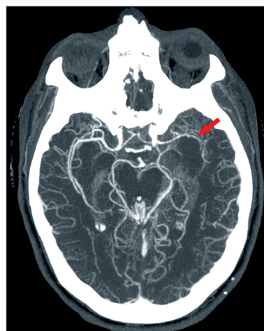
Figure 3. Angio CT-scan showing vasospasm of the left MCA (arrow).

Cerebral vasospasm after tumour resection is an uncommon complication 9 . It has been described after resection of pituitary tumours via transcranial and transsphenoidal 8,9,11-19 . So far, only 21 cases of vasospasm after TSS pituitary adenoma removal have been reported, and the most of them were operated in the microscopic era. We present a case of cerebral vasospasm after pituitary adenoma resection via