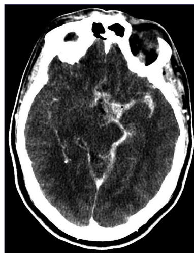
Figure 2. Postoperative CT scan showed SAH filling basal cisterns.

The patient underwent an endoscopic, endonasal expanded transsphenoidal, transtuberculum approach for removal of the tumour. A macroscopic total resection of the sellar and suprasellar component was achieved, leaving a rest of tumour in both cavernous sinuses as planned. As a unique intraoperative incidence, an important venous bleeding was observed during resection of the suprasellar component, which was controlled with pressure and haemostatic materials. A multilayer reconstruction with synthetic materials was done, achieving a hermetic closure. A lumbar drainage was placed in order to prevent postoperative CSF leak. Postoperative CT scan showed a significant amount of blood in the subarachnoid space filling the basal cisterns, involving the left suprasellar, sylvian, ambiens and prepontine cisterns (Figure 2). There was no evidence of ventricular dilatation.